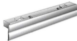
2 Slat Standard Valance

NOTE: 2 Slat Valance comes as flush valance, there are NO returns.