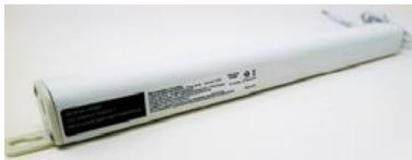
Rechargeable Battery Block