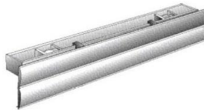
2 Slat Standard Valance

NOTE: 2 Slat Valance comes as flush valance, there are NO returns.