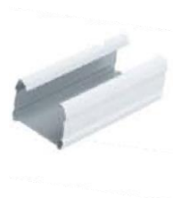
2 Slat Standard Valance